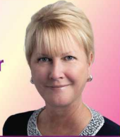
RI President 2022-23